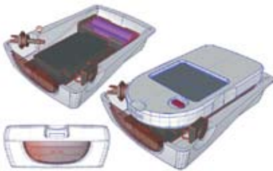
The glucometer unit prototype repackaged to accommodate the infra-red transmitter.